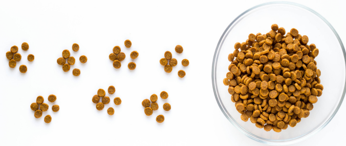
Pea protein concentrate in high protein diets